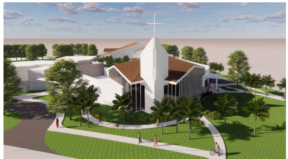
The Sanctuary looking from Southeast to Northwest!