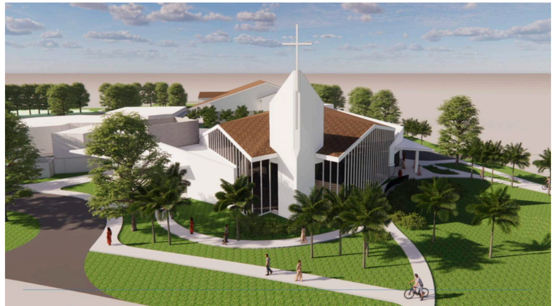
The Sanctuary looking from Southeast to Northwest!